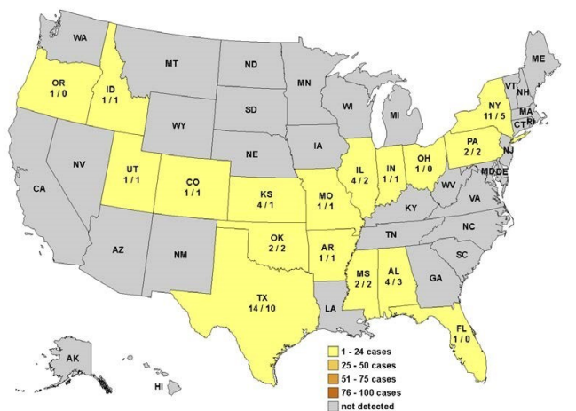
FIGURE 1 : Reported numbers of horses and premises testing positive for EIA, 2016.

In October, the Montana Department of Livestock (MDOL) announced the detection of several EIA positive equids belonging to a single owner in Gallatin County. The positive animals were tested for an upcoming out of state movement. The premises and all associated equids was placed under quarantine