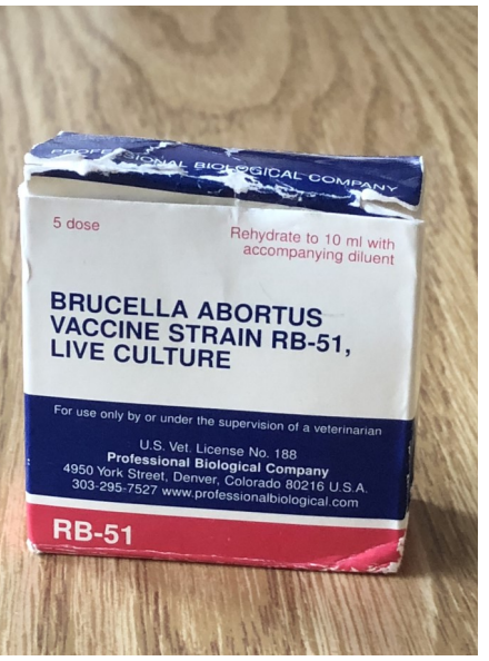
FIGURE 3: Brucella abortus strain RB51 vaccine.